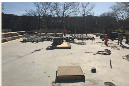
Structural Steel on Podium Slab